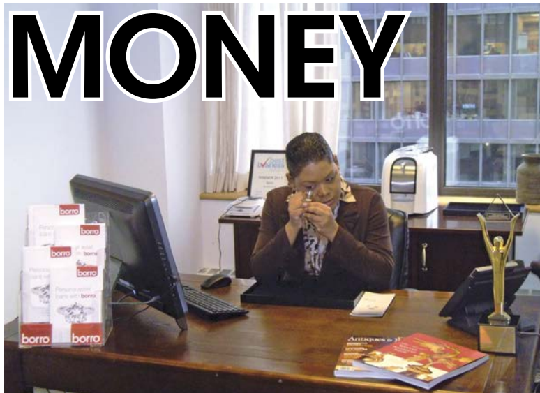
A borro appraiser inspects a client's merchandise in Manhattan